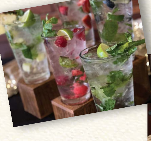
FLAVORS: Blueberry, Mint, Pineapple, Raspberry, and Strawberry